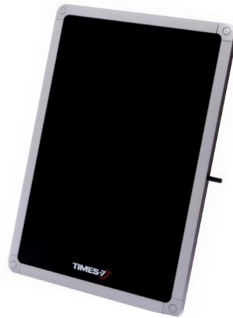
The SlimLine A6032